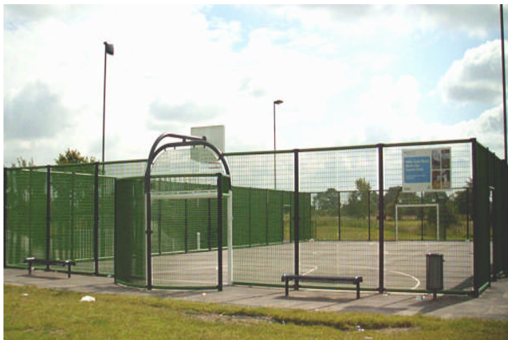
Wyke Gate MUGA